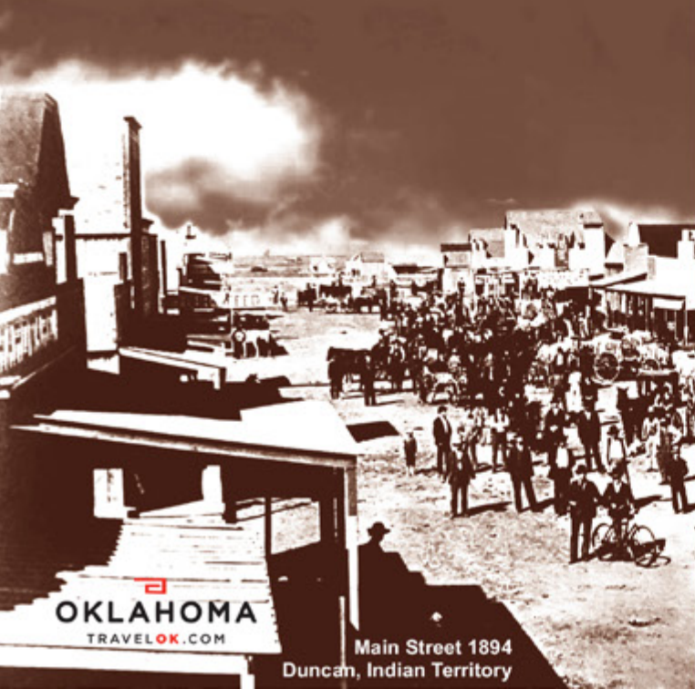
Main Street 1894 Duncan, Indian Territory