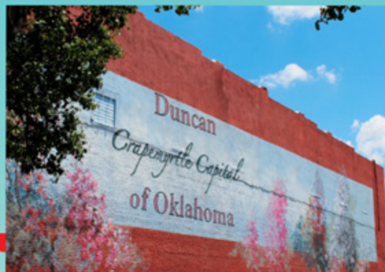
Palace Theater, Main and 10th St H-9 on Map

In 2008 Duncan became the Crapemyrtle Capital of Oklahoma. Be sure to drive the Crapemyrtle Trail while in Duncan. The blooms are at their best late June through mid-August.