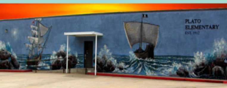
Plato Elementary School, home of the "Plato Pirates".

In 2008 Duncan became the Crapemyrtle Capital of Oklahoma. Be sure to drive the Crapemyrtle Trail while in Duncan. The blooms are at their best late June through mid-August.