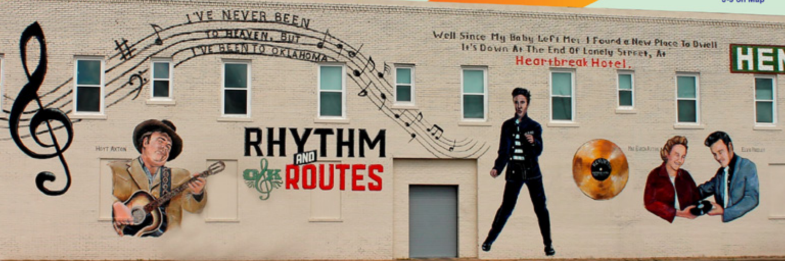
Henderson Building Main and 7th St. J-9 on Map